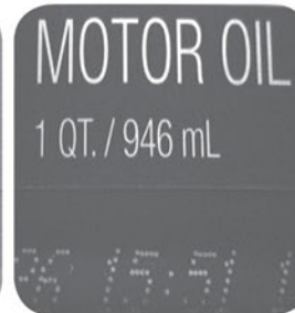
After MidOpt BP470 Blue Bandpass Filter

Increase Contrast and Improve Image Quality